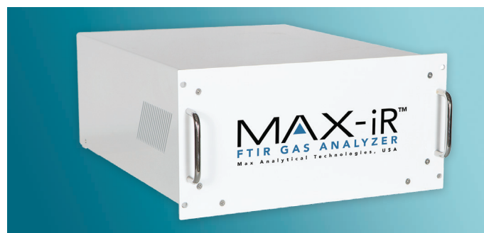
MAX-iR FTIR gas analyzer.

A deuterated triglycine sulfate (DTGS) detector comes standard with the MAX-iR analyzer. With the optional StarBoost technology, users can choose between indium arsenide (InAs) or mercury-cadmium-telluride (MCT) detectors. All systems come standard with Thermo Scientific™ MAX-Acquisition™ Automation Software and MAX-Analytics™ Software that provide industry-leading analytics, factory integration tools, high speed identification of compounds, and measurement accuracy/stability without the need for calibration.